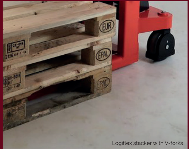
Logiflex stacker with V-forks